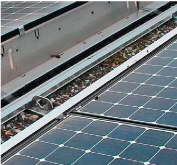
Anchor points for photovoltaic installations