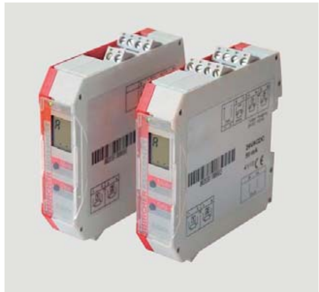
Pressure-sensitive edges: control units