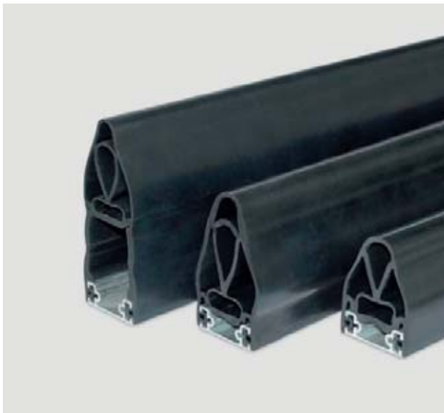
Pressure-sensitive edges: sensors