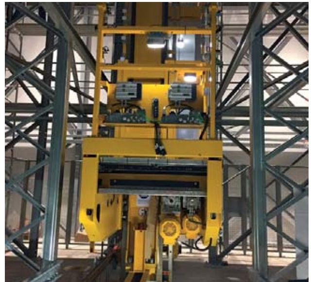
Storage and retrieval machines