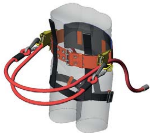
Belt for work positioning and restraint