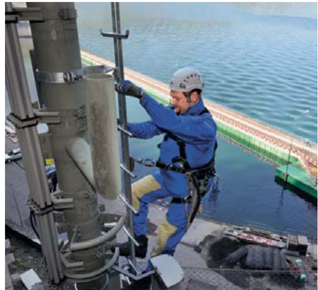
Guided type fall arrester